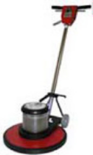
Low Speed Floor Buffer

A floor buffer machine is designed to clean surfaces including hard natural stone tiles and pavers. Rotary brushes pick up dirt from a surface, leaving a glossy, polished finish on the floor. The buffer machine consists of a handle which is connected to a horizontally rotating head. Beneath the head a large circular scrubbing pad is attached. The scrubbing pad spins in one direction and is usually electric, battery or propane powered. The type of power source will determine the maximum speed the pad can rotate and what cleaning process can be achieved. Some floor buffers contain a tank for solutions. Cleaning solution can be directly dispensed from the tank into the scrubbing pad and onto the floor. NOTE if Alkaline Cleaner is being applied ensure that the solution tank is stainless steel or plastic as iron and other metals will be corroded by Alkaline Cleaner because it is an oxidizer.