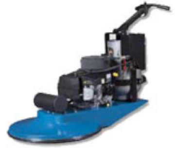
High Speed Floor Buffers