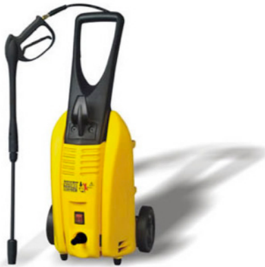
Electric Pressure Washer