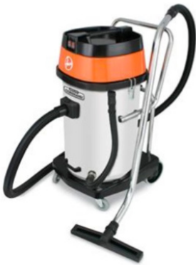
Commercial Wet/Dry Vac