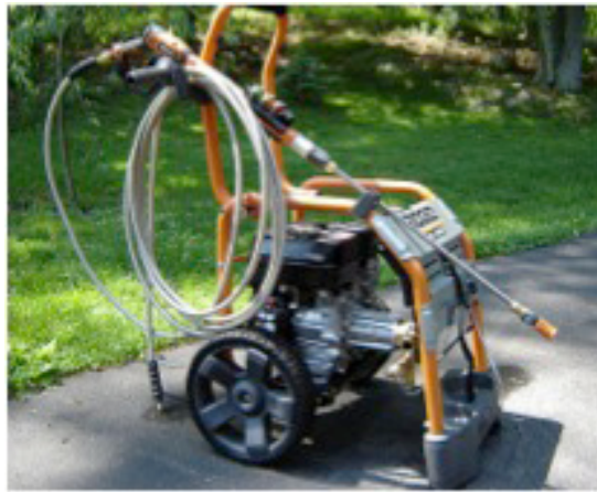
Gasoline-Powered Pressure Washer