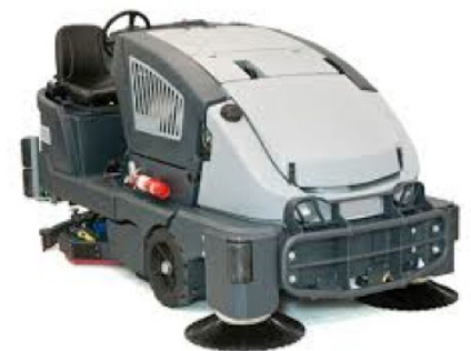
Manual Ride-On Scrubber